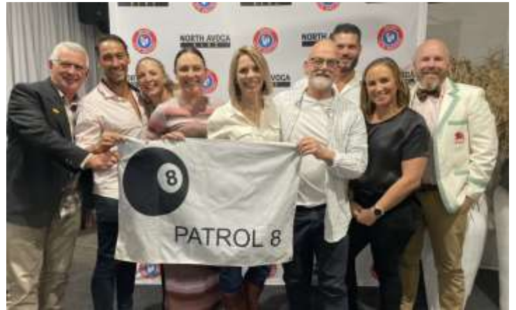
Patrol of the Year – Patrol 8

A big congratulations to our Life Saving major award winners and Patrol Service awards from our recent Senior Presentation. Patrol awards not collected on the night are with your Patrol Captains.