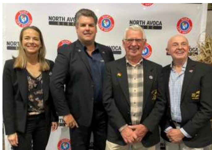
Senior Presentation – Life members

I'd also like to thank our wonderful FONA's and sponsors for their continued support this season. We simply couldn't do what we do without the generosity of these groups.