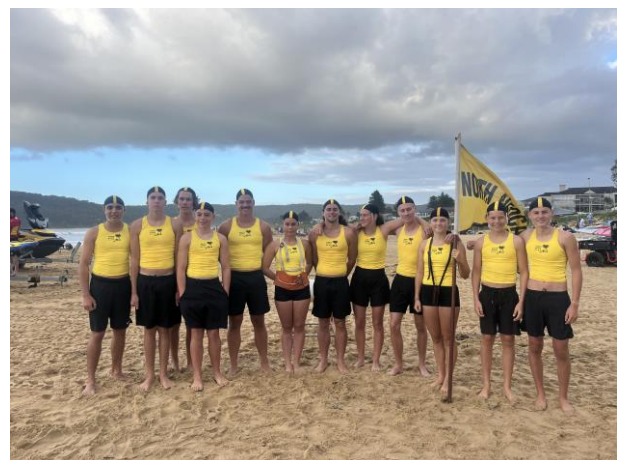
U23 March Past Gold Medallists