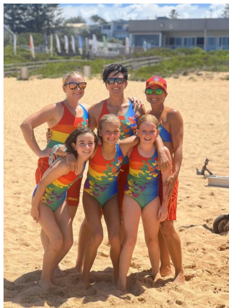
Some of our patrolling families celebrating the commencement of SLS Rainbow Patrol Weekend